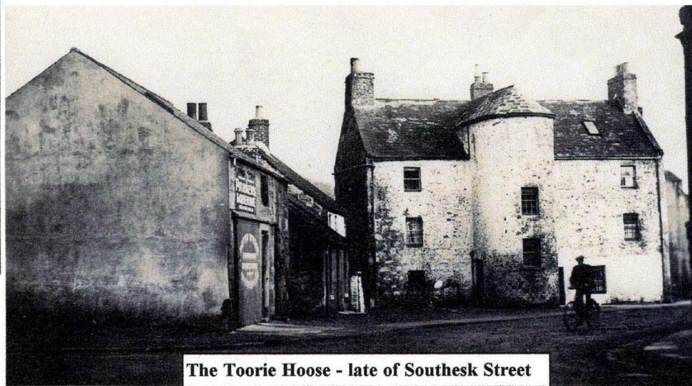
The Toorie Hoose - late of Southesk Street

In 1957 a small group of people got together in an attempt to prevent the demolition of the Toorie Hoose in Southesk Street, an historic building of significance to the history of Montrose. They were unsuccessful, but the Montrose Society was successfully formed.